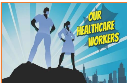
Find MAMRT on Facebook: @ MBMRTs